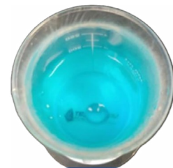
ANTIFOG - 24 HOURS