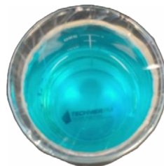
CONTROL - 0 HOURS